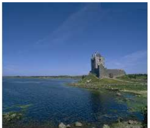
Dunguaire Castle, Kinvara, County Clare

Many Clare surnames are derived from the powerful septs that ruled over the area. Common surnames are O'Brien, McNamara, O'Grady, McInerney, Hickey, Griffin, Whelan, McMahan, Clancy and Considine. In addition many unusual surnames such as Talty, Lillis, O'Halloran, Minogue, Clune, Finucane, Ginnane, O'Davoren, McGann, McLysaght, and O'Loughlin can be found due to the isolated nature of the county.