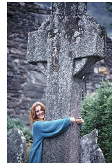
Hugging the miraculous healing cross at Glendalough, Ireland

A local legend states that if one encircles the cross with one's arms and makes a wish concerned with healing, that wish will be fulfilled according to the depth of one's love of God.