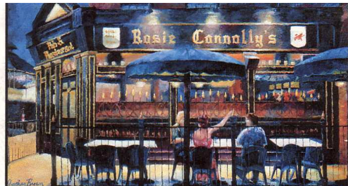
Rosie Connolly's Pub Restaurant 1548 E. Main Street Richmond, Virginia 23219 804-343-1063