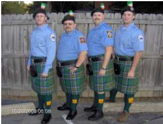
The IAS is delighted to add Bill to the Board!