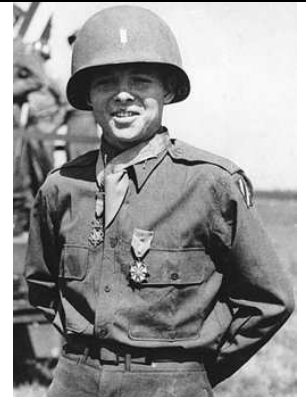
Yes – He does look young in this photo. Audie Murphy received the Medal of Honor at age 19 .

Audie Leon Murphy, born June 20, 1925, son of poor Texas sharecroppers. He rose to national fame as the most decorated U.S. combat soldier of World War II. Among his 33 awards and decorations was the Medal of Honor, the highest military award for bravery that can be given to any individual in the United States of America, for "conspicuous gallantry and intrepidity at the risk of his life above and beyond the call of duty." He also received every decoration for valor that his country had to offer, some of them more than once, including 5 decorations by France and Belgium. Credited with either killing over 240 of the enemy while wounding and capturing many others, he became a legend within the 3rd Infantry Division.