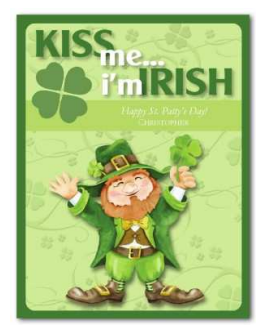
Seriously – Haven't you always wanted to wear one of these???