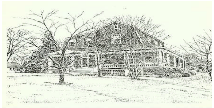
The Burke Home... Where it all Began