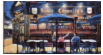
Rosie Connolly's Pub 1548 E. Main Street Richmond, Virginia 23219 804-343-1063