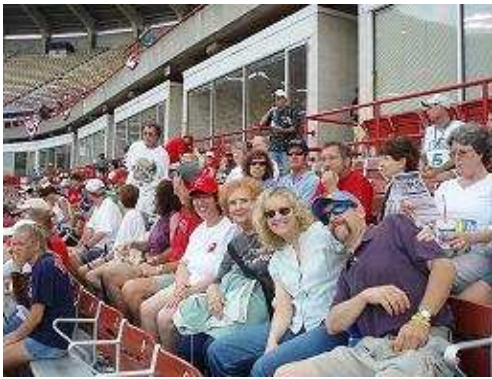
The IAS Gang!