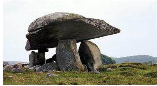
(County Donegal - On the east side of the lane behind the Kilclooney church lies this magnificent site.)

The exact nature of stone circles and the rituals practiced among them have long occupied the great archaeological minds. They may have been agrarian calendars, or astronomical instruments, monuments to deceased chiefs, meeting places or cattle markets. There are probably as many explanations as there are circles.