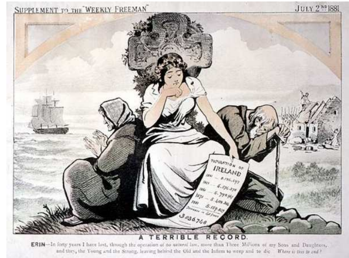
“A TERRIBLE RECORD” – (Source: Supplement, Weekly Freeman, 2 July 1881) (Caption)

ERIN- “In forty years I have lost, through the operation of no natural law, more than Three Million of my Sons and Daughters, and they, the Young and the Strong, leaving behind the Old and Infirm to weep and die. Where is this to end?”