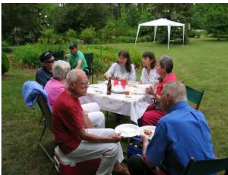
The Lunch Bunch!